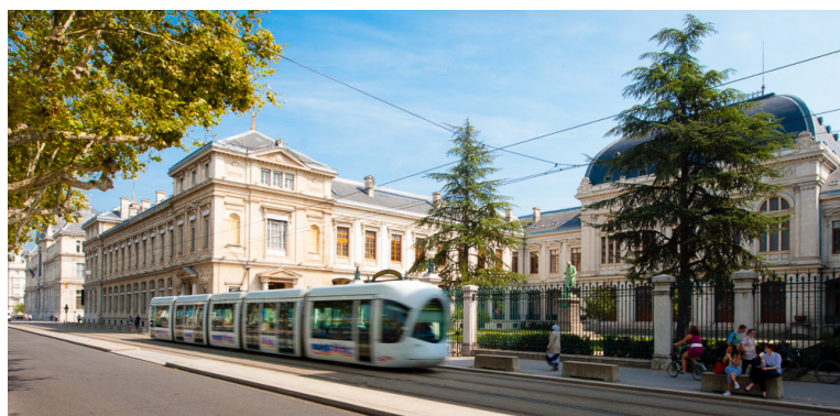
University Lyon 2, conference venue