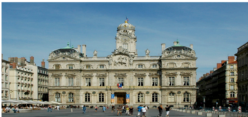
City Hall of Lyon