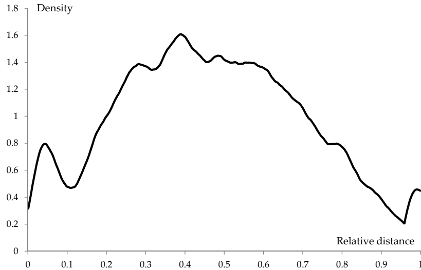
Figure 1: Probability distribution function of the relative distance for new constructions, French urban areas 2006-2012

Notes: All years of data used. 218,657 observations. For each new construction, we compute the distance between the centroid of its municipality and the centroid of its urban area and divide by the greatest observed distance for any new construction in this urban area.